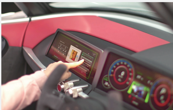
HAPTIVITY® for Automotive Infotainment Displays