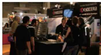
The Kyocera Booth

Exhibits were evaluated by visitors to the fair and certain mass media companies. In the Kitchen Division, Kyocera’s ceramic knife was highly rated for design and performance. This was the first time a product by a Japanese corporation won the award.