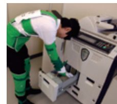
Testing usability while wearing a senior citizen “Experience Kit”