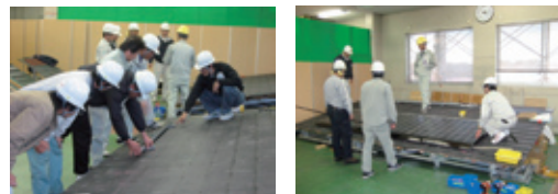
Technician Certification Seminar

In addition to the industry’s first long-term product guarantee (a 10-year guarantee including damage by typhoon, lightning and fire), KYOCERA Solar Corp. itself confirms completion of installation and market quality after conducting a final test and inspection. The Certified Technician System further raises quality.