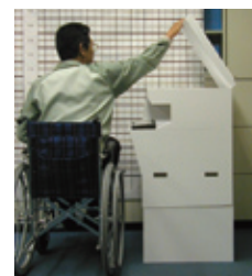
Testing usability from a wheelchair

Additionally, studies of conditions in which customers use the products are applied to facilitate product improvement. The “Easy-to-Use” universal design features incorporated into the monochrome MFPs [KM-4050/5050] were highly acclaimed. As a result of such activities, KYOCERA MITA Corp. received a Good Design Award for the first time. KYOCERA MITA Corp. will continue to enhance universal design measures, undertaking development of people-friendly products that will satisfy customers.