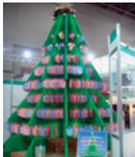
Huge 4.5 m high eco-tree

The Kyocera Group participates in and makes presentations at environmental exhibitions held in various locations every year. In FY2008, we also made a presentation at Eco-Products 2007, which is the largest environmental exhibition. A large 4.5-meter high eco-tree was displayed at Kyocera's booth. This tree was decorated with a commitment to reduce CO 2 emissions from about 4,300 people who participated in the Eco Rally. After participating in the Eco Rally, which included quizzes and learning about the environment, they were requested to write what can be done to reduce CO 2 emissions in daily life on cards and decorate the tree with them. In the three-day Eco-products spreading event, commitments equivalent to a reduction of 1,456.2 kg CO 2 emissions were collected from people.