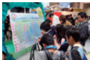
Children writing their working promises to reduce CO 2 emissions