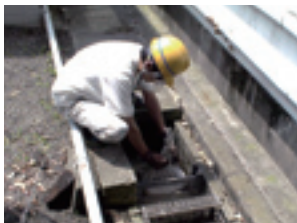
Emergency training (Kagoshima Kokubu Plant)

Assuming the inevitability of accidents and emergencies which may affect the environment, we have taken preventative countermeasures such as the installation of dikes. We have also prepared procedures for dealing with emergencies. To ensure that employees are familiar with these procedures, we hold emergency training drills more than once each year.