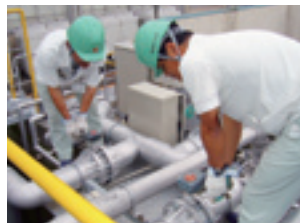
Emergency training (Kagoshima Sendai Plant)