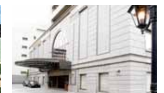
Hotel Nikko Princess Kyoto (Kyoto, Japan)