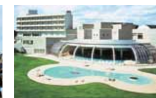
International Golf Resort Kyocera (Kagoshima, Japan)