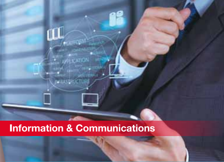
Information & Communications

By focusing our combined strengths on the above markets, the Kyocera Group will keep supplying products and services of value, supporting a more comfortable, more sustainable world.