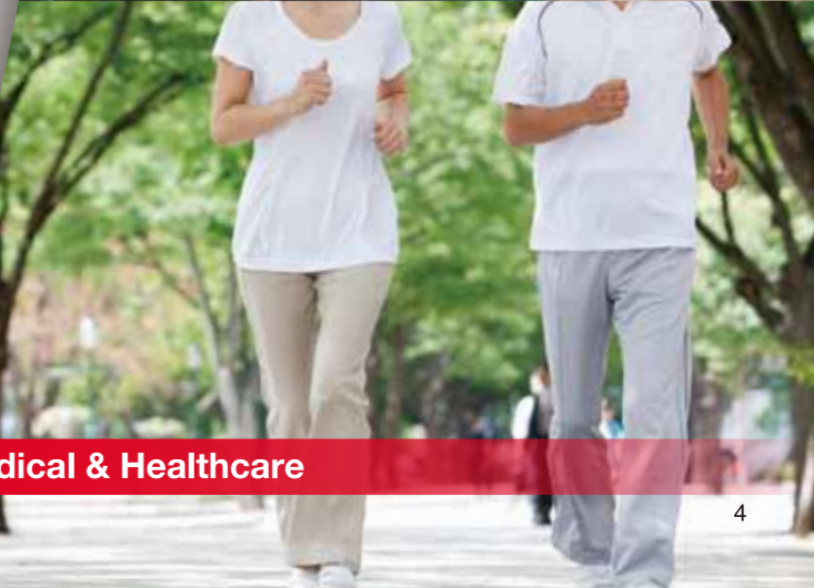
Medical & Healthcare