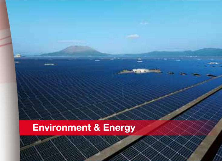
Environment & Energy